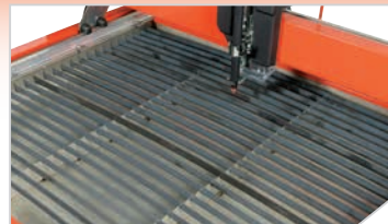
Stainless Steel Water Tray