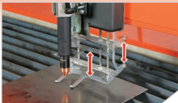
Soft Sense Torch Height Control